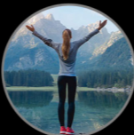
PARADISE NEAR THE ROCKIES