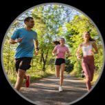
A GARDEN OASIS