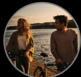
RESORT STYLE LIVING